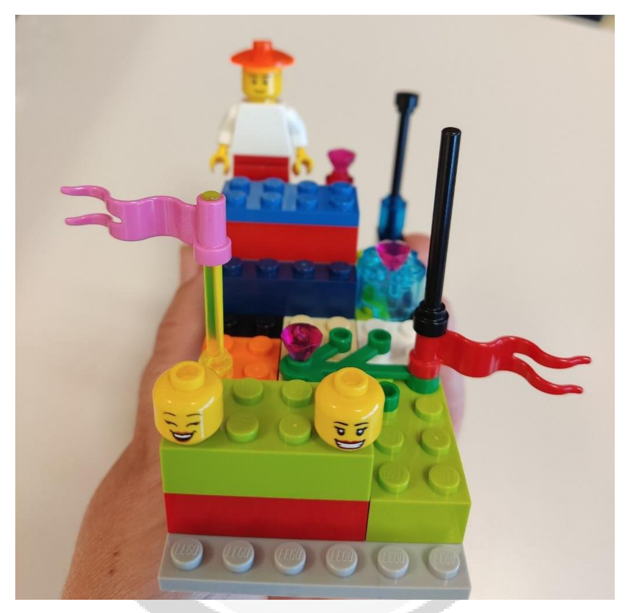
Figura 4: example of a tower