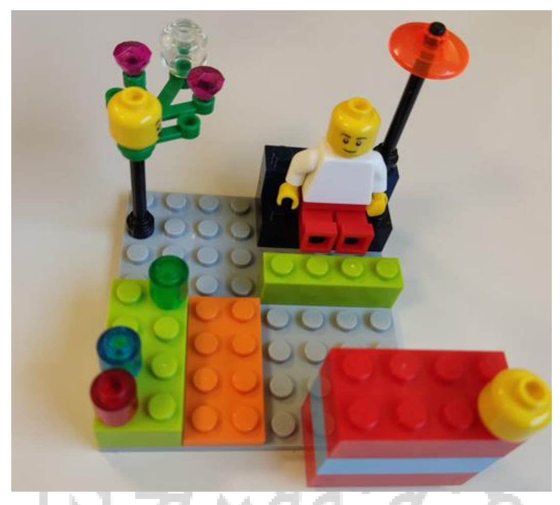
Figura 6: example of "Introduce yourself" 3D model