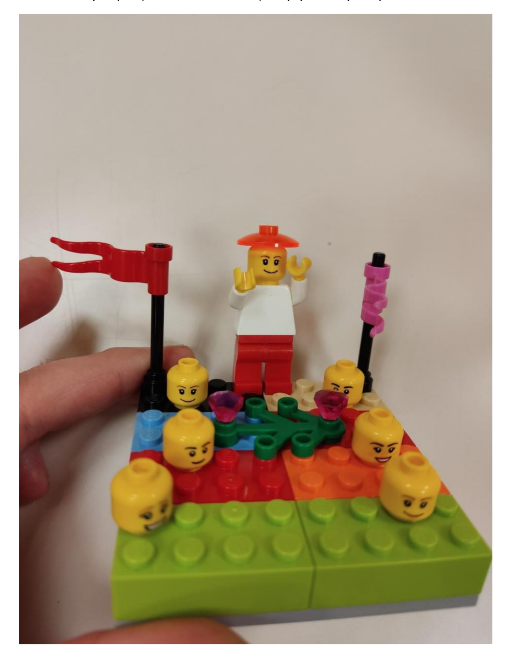
Figura 14: model from additional exercises (4)

Which persons will be involved in the realization of your future goals (the first or second model)? Why? Explain. How can people (the second model) help you on your path in the future?