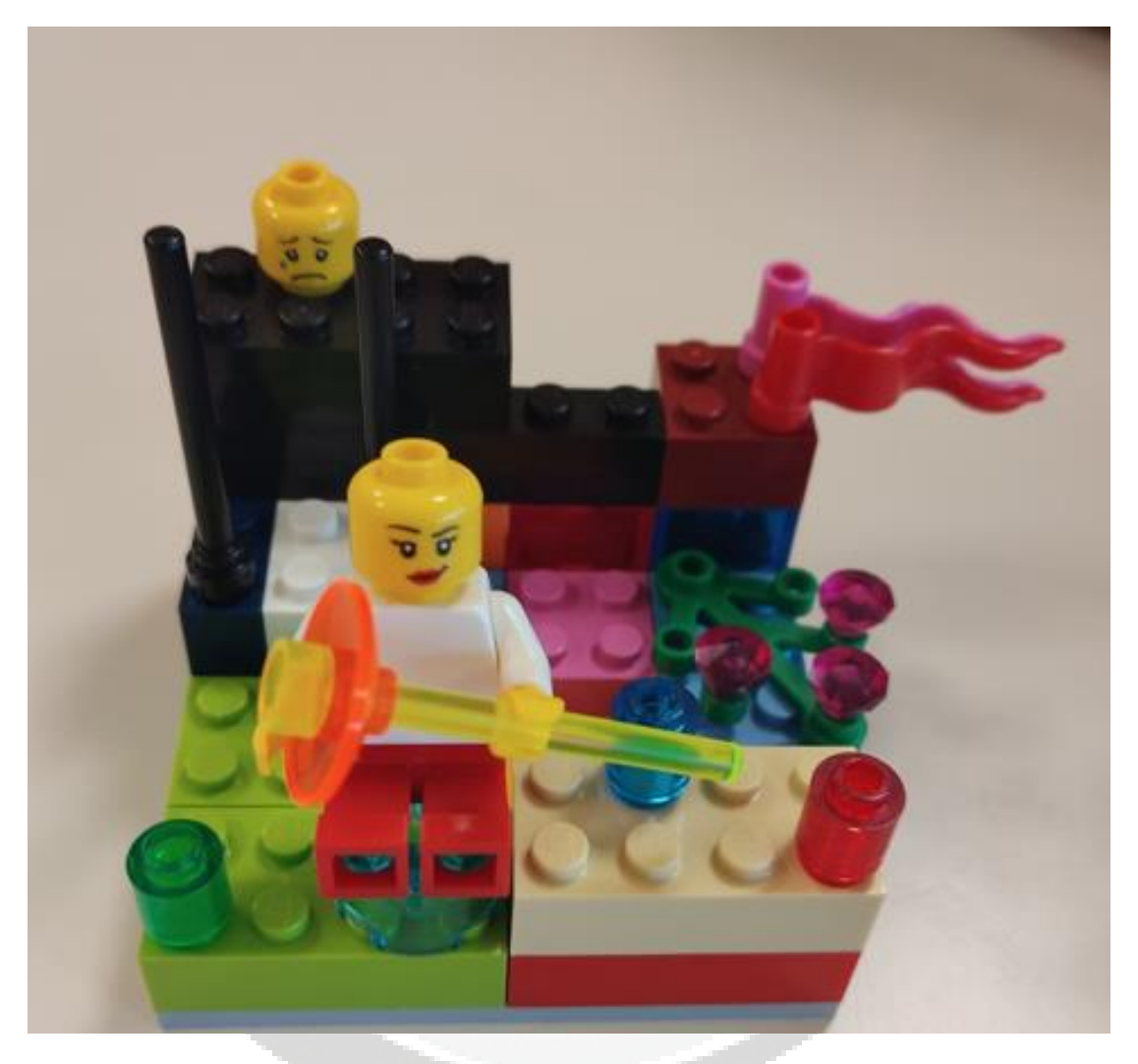
Figura 11: model from additional excercises

Think about the person from the past/or present who caused negative feelings which made you feel uncomfortable and caused you negative emotions. Create a model using emojis. Represent your model to others.