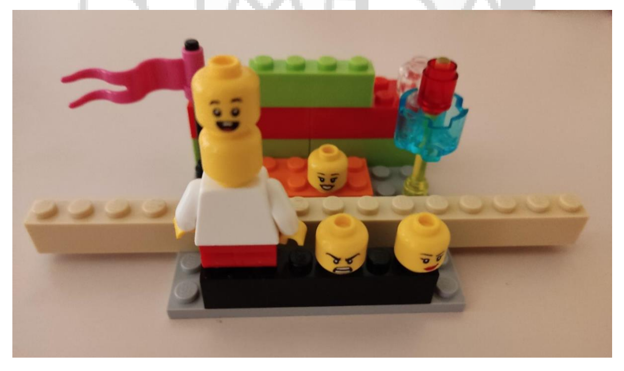
Figura 13: model from additional exercises (3)

Now think of a person with whom you feel comfortable and relaxed. Create a model using emojis. Represent your model to others.