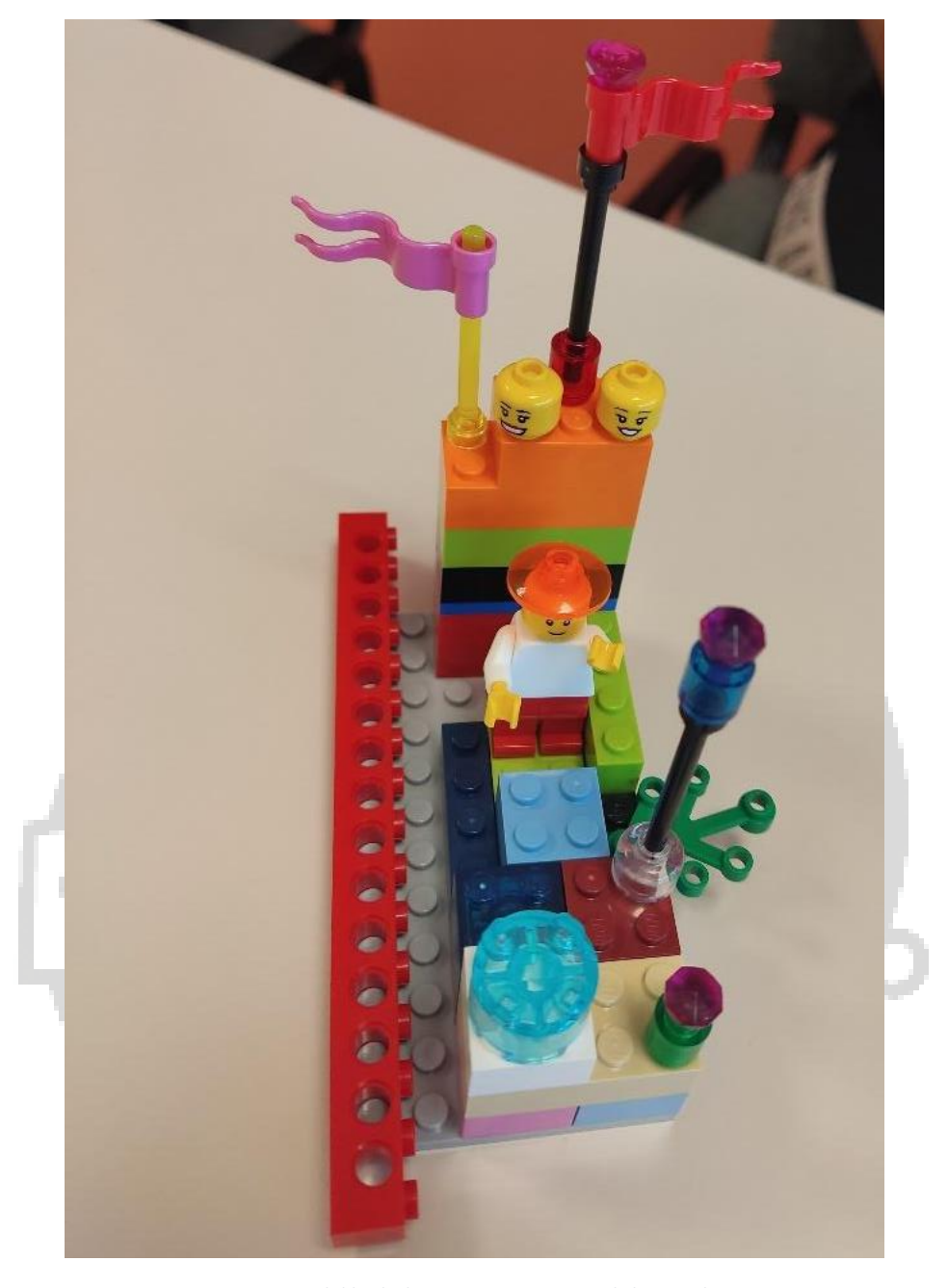
Figura 3: A model built during RE.M.I.D.A. workshop with emoji