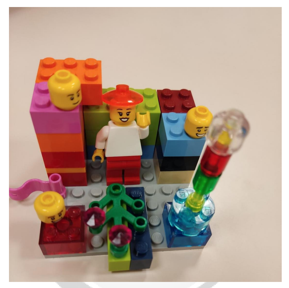
Figura 7: upgrading model with emoji