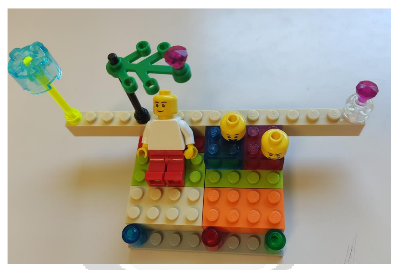
Figura 9: Upgrade 3D model

After that, they build a model that represents participants' future goals and achievements.