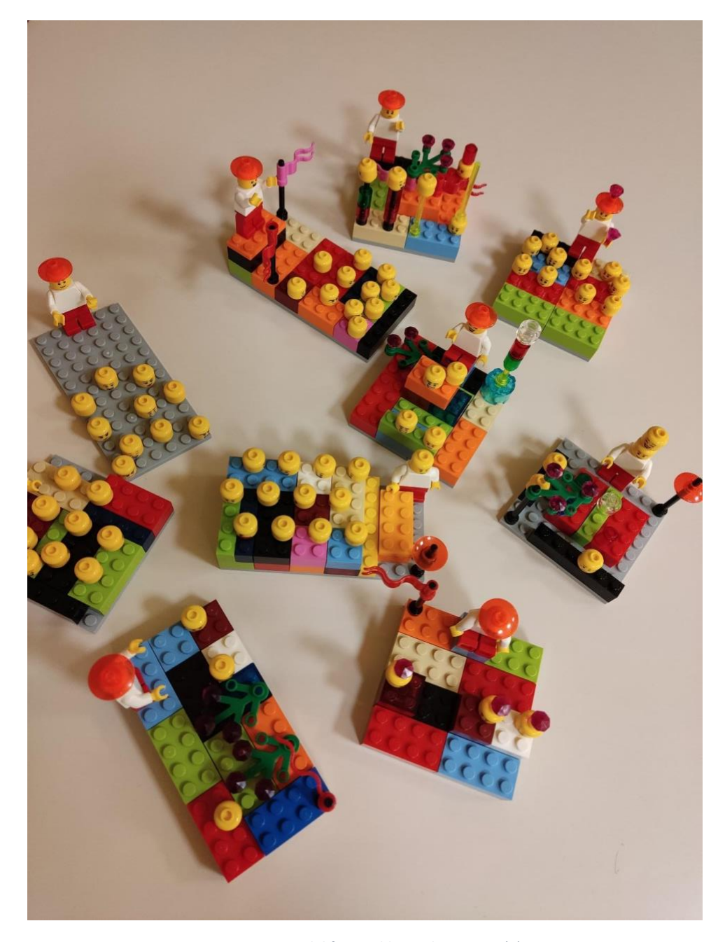
Figura 15: model from additional exercises (5)