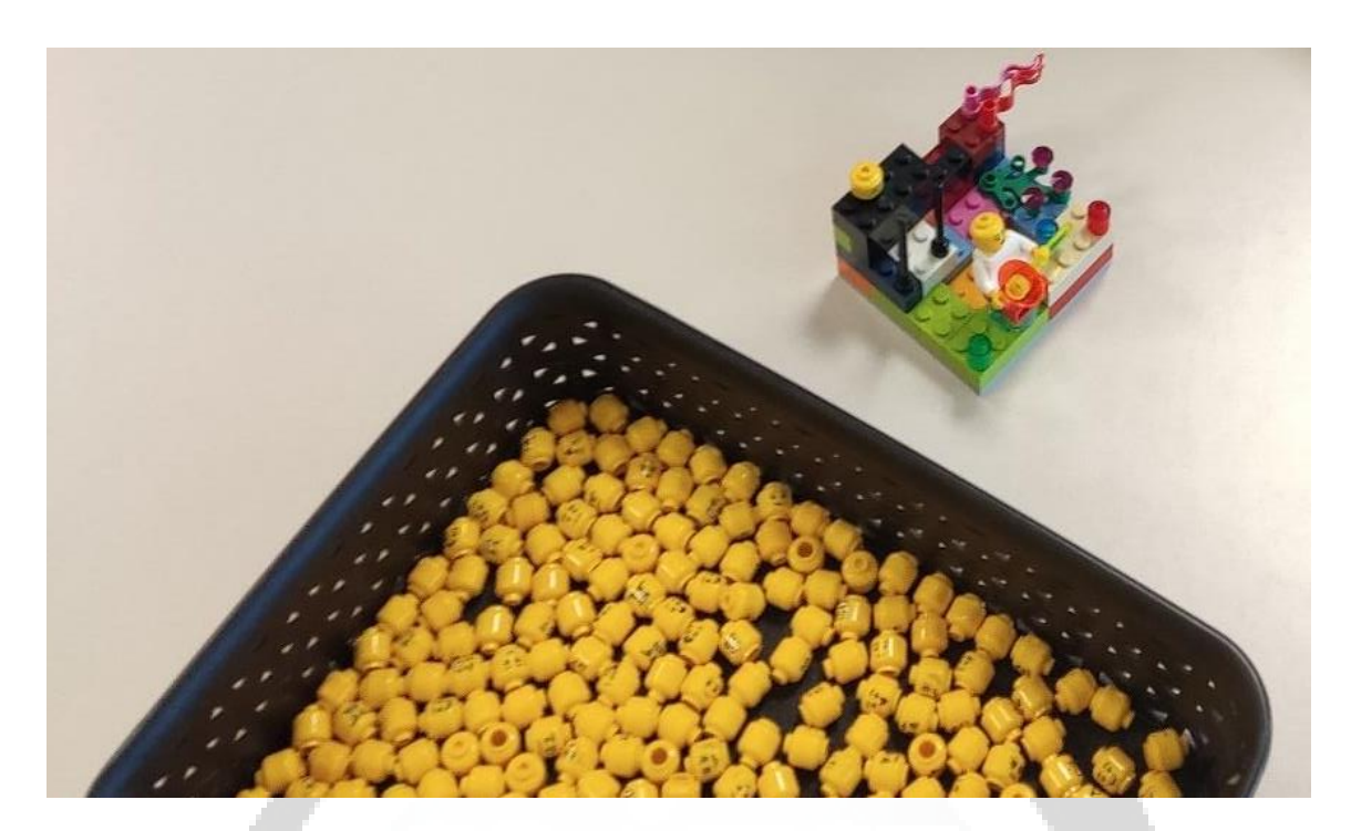
Figura 2: A RE.M.I.D.A. model with emoji